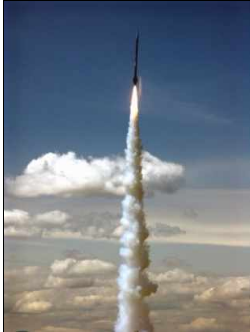
The CRAP SHOOT heads for 8000 ft on a K700

This means that unless and until BATFE properly promulgates a rule rescinding the 1994 PADS exemption, fully assembled rocket motors are propellant actuated devices under the law and are exempt from regulation by BATFE." There's a lot more to read including a copy of counsels interpretation of the ruling communicated to the U.S. Attorney's office. ~Jim Abrames