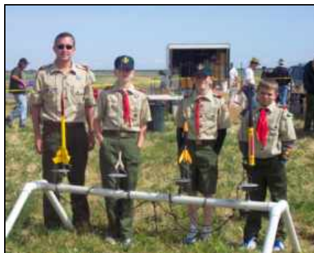
Members of Fresno's Boy Scout Troop 301