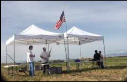
RSO ready for flyers

Serving the Central California Chapter of the Tripoli Rocketry Association - MAY, 2004