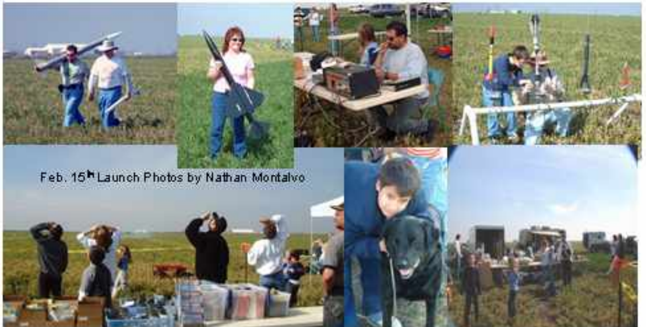
Feb. 15 th Launch