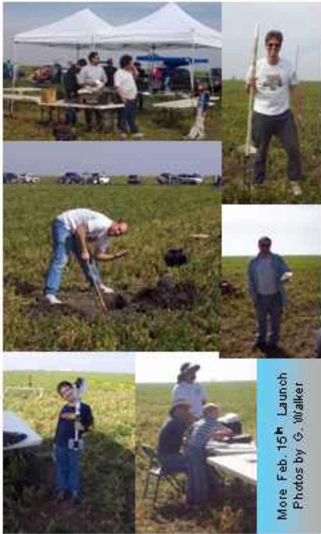
More Feb. 15 th Launch Photos