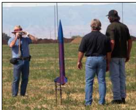
For those who don't recognize me, I'm the guy with the 49ers straw hat with the camera stuck to my nose.