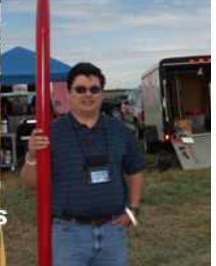
More Sept. 19th Photos by Sam Montalvo