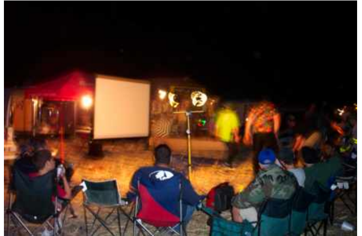
Duane Uhl's portable theatre

system. Duane wowed the crowd with a movie, October Sky , of course, and some Rock videos that included Fleetwood Mac.