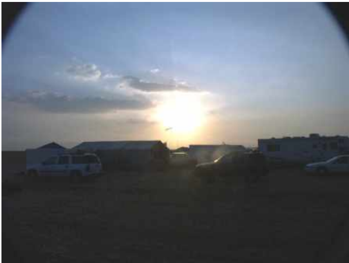
The sun sets on Saturday's launch

After a long day of flying rockets, chasing rockets, buying rockets and watching rockets, the range was shut down. By this time my whole family had arrived and we partook of the great food made available by the LUNCH PAD and CK's, as did the large group of folks who typically stay for the Saturday evening festivities.