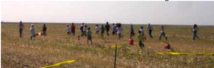
Did someone say CANDY?

The hands-down favorite rocket of the day, for the kids in the crowd, had to be Anthony Cooper's 72" stretched Aerotech G-Force. Why? Anthony's Pinata rocket was packed with 2 pounds of candy! The on board GWIZ first activated the parachute, and the next deployment was the candy ejected at 500 feet! When the kids got the A-OK, they rushed the field like a bunch of race horses out of the gates!