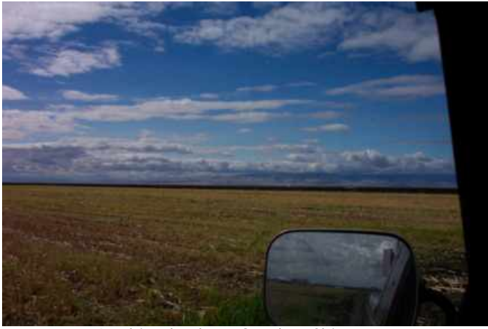
Looking back on October Skies 2004

While the weather didn't quite cooperate for Sunday, the 5 th Annual October Skies launch was a great time to be had by all. There were 238 flights on Saturday alone, by 90 different individuals. If time and space allowed, I would mention each and every one of you here in the newsletter because ALL of you do your part in making launches like this a success and a joy to attend.