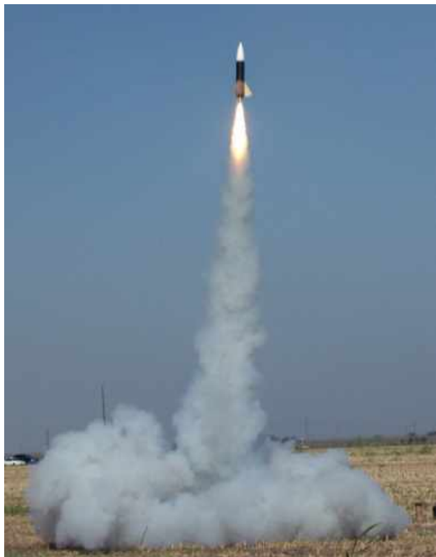
Larry Frieson's Mini Magg on a K458

Larry's 2 nd flight was a project that he had been working on for a couple of years, but hadn't had time to complete and fly. Today was the day! Weighing just over 20 lbs, Larry's 31" X 5.5" LOC Mini Magg would lift off on an Aerotech K458 for a great flight. The Black Sky ALTACC deployed the dual chutes and the Magg floated off to the northeast. After a lot of searching and just a bit of frustration, the Magg seemed to be lost. Bummer!